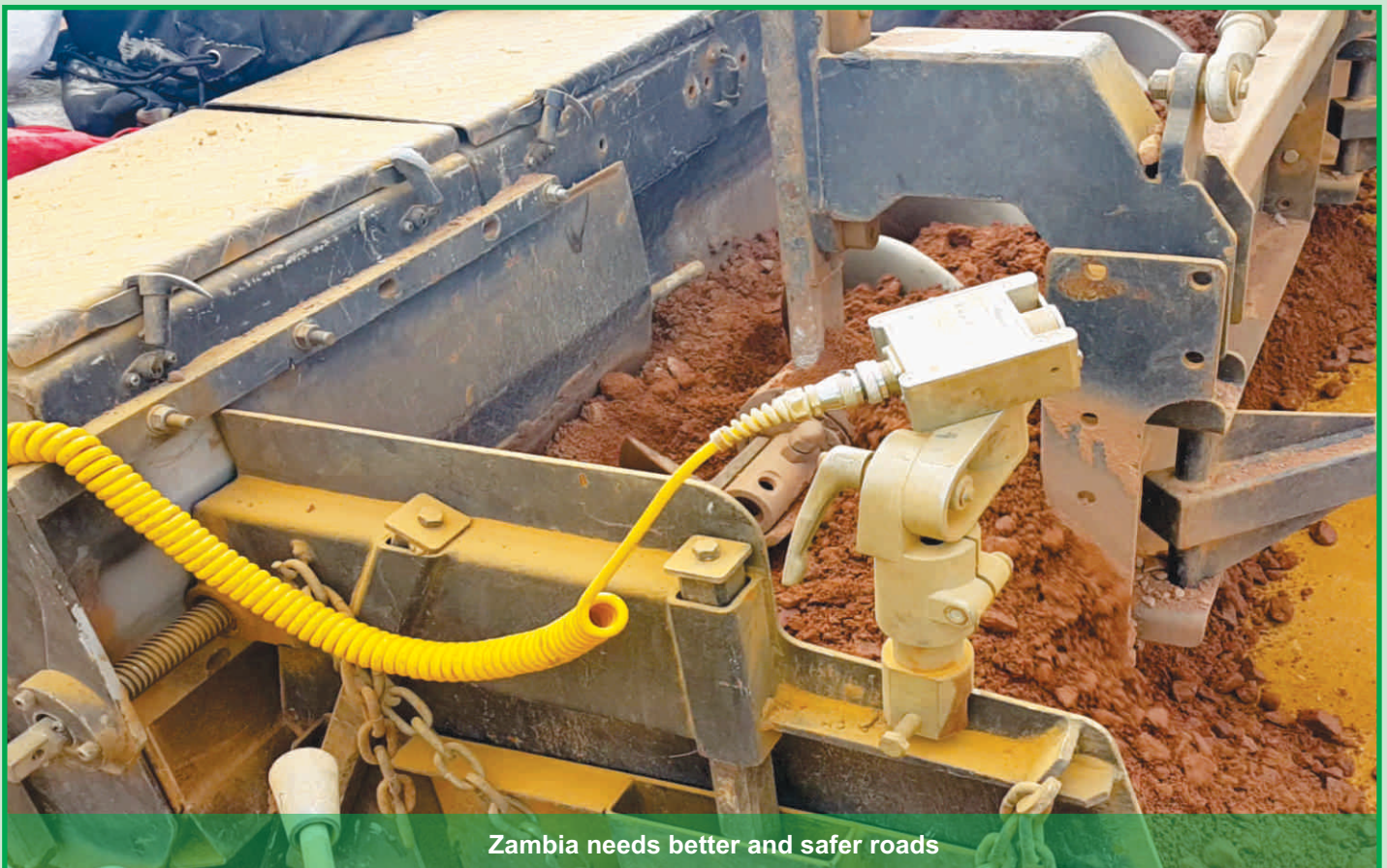
Zambia needs better and safer roads

The convention underscored the need for a multi-sector approach in the fight against road crashes.