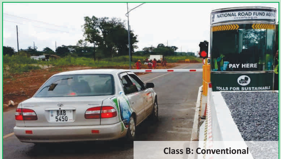
Class B: Conventional