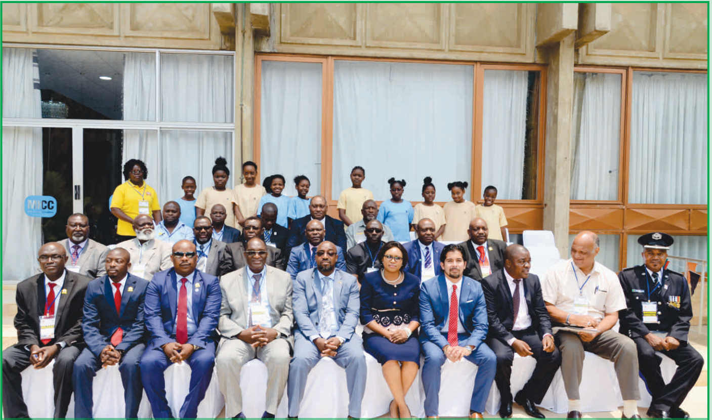
Transport and Communication Minister Hon. Brian Mushimba (centre) takes a photo - op with dignitaries at the conference