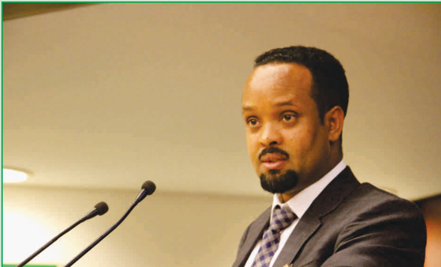
Honourable Ahmed Shide, Transport Minister in the Federal Democratic Republic of Ethiopia officiated at the Annual General Assembly