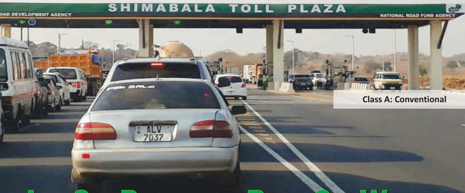
Class A: Conventional