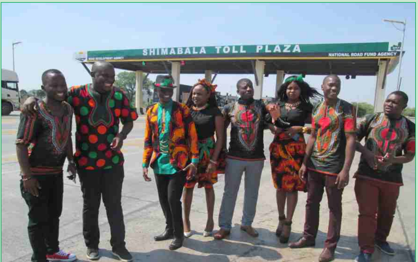
Team Shimabala clad in national colours