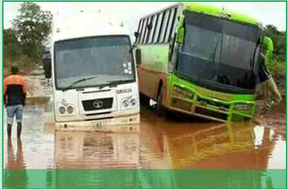
Chingola - Solwezi Road before rehabilitation (above) and after rehabilitation below