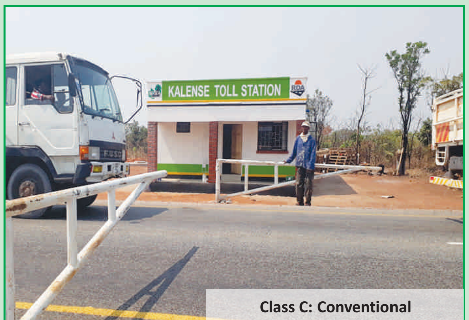
Class C: Conventional