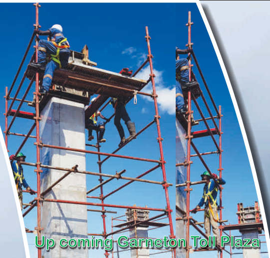
Up coming Garneton Toll Plaza