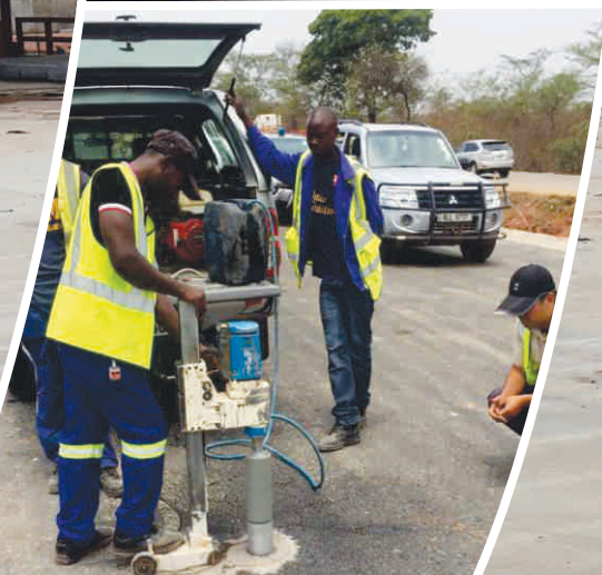
Value for Money